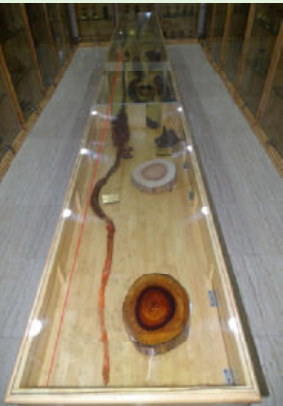
Museum specimens at BSI, Sri Vijaya Puram 'laljii' to the above generic names, a press release from BSI said.